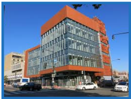
Howard University, Office of Research 2201 Georgia Avenue, NW 421E Washington, D.C. 20059