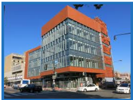
Howard University, Office of Research 2201 Georgia Avenue, NW 421E Washington, D.C. 20059